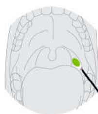
Oropharyngeal Swab Sample

Insert minitip swab with a flexible shaft (wire or plastic) through the nostril parallel to the palate (not upwards) until resistance is encountered or the distance is equivalent to that from the ear to the nostril of the patient, indicating contact with the nasopharynx. Swab should reach depth equal to distance from nostrils to outer opening of the ear. Gently rub and roll the swab. Leave swab in place for several seconds to absorb secretions. Slowly remove swab while rotating it. Specimens can be collected from both sides using the same swab, but it is not necessary to collect specimens from both sides if the minitip is saturated with fluid from the first collection. If a deviated septum or blockage creates difficulty in obtaining the specimen from one nostril, use the same swab to obtain the specimen from the other nostril.