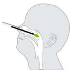
Nasopharyngeal Swab Sample

Specimens obtained early during symptom onset will contain the highest viral titers; specimens obtained after five days of symptoms are more likely to produce negative results. Inadequate specimen collection, improper specimen handling and/or transport may yield a falsely negative result; therefore, training in specimen collection is highly recommended due to the importance of specimen quality for generating accurate test results.